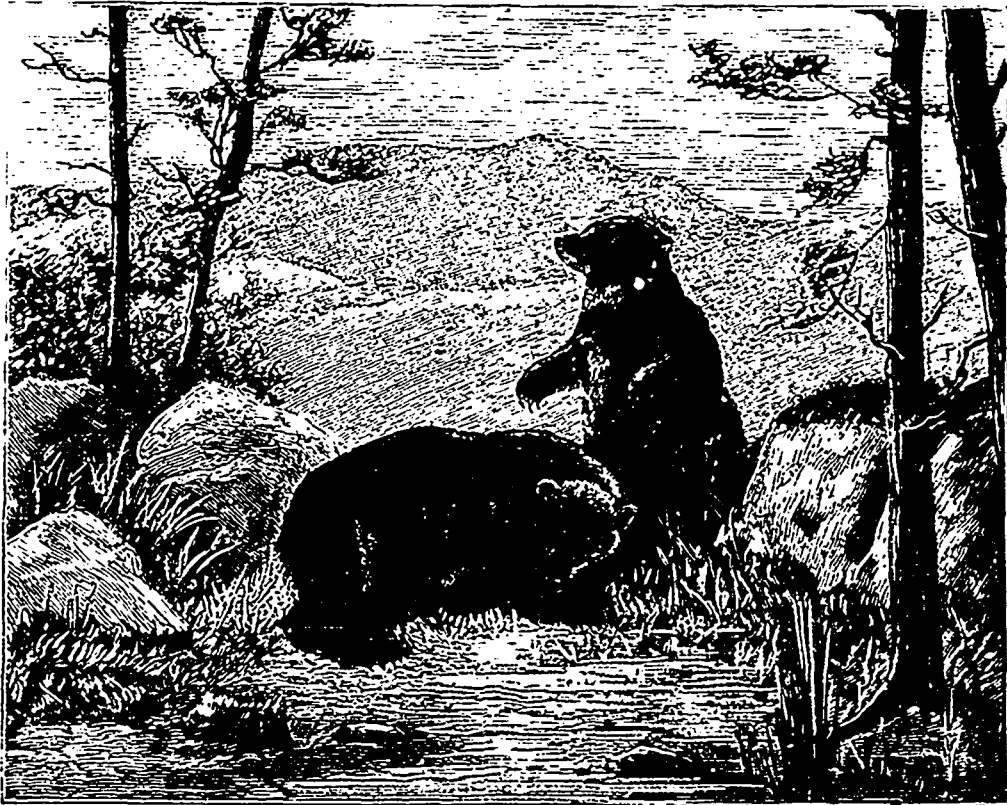
BEARS AT HOME.