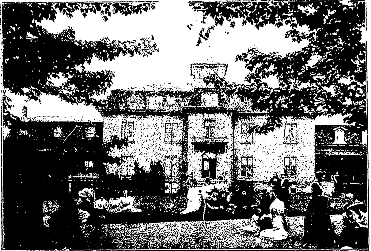
COMPTON, P.Q., LADIES' COLLEGE.

of increase in divorce and crime, and the widespread discontent, are due to the want of self-control and cheerful contentment, resulting from the lack of proper religious teaching in the public schools."