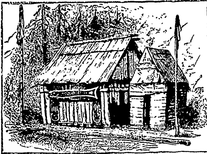
GRAVES OF INDIAN CHIEFS, NEAR YALE, B.C.

The Indian work of the diocese of New Westminster comprises the Thompson Indians—who live at Lytton and along the banks of the Fraser, Thompson, and Nicota—and the Yale Indians—occupying the banks of the Lower Fraser from a point nine miles above Yale down to Chilliwack, and, in the fishing season, at the coast.