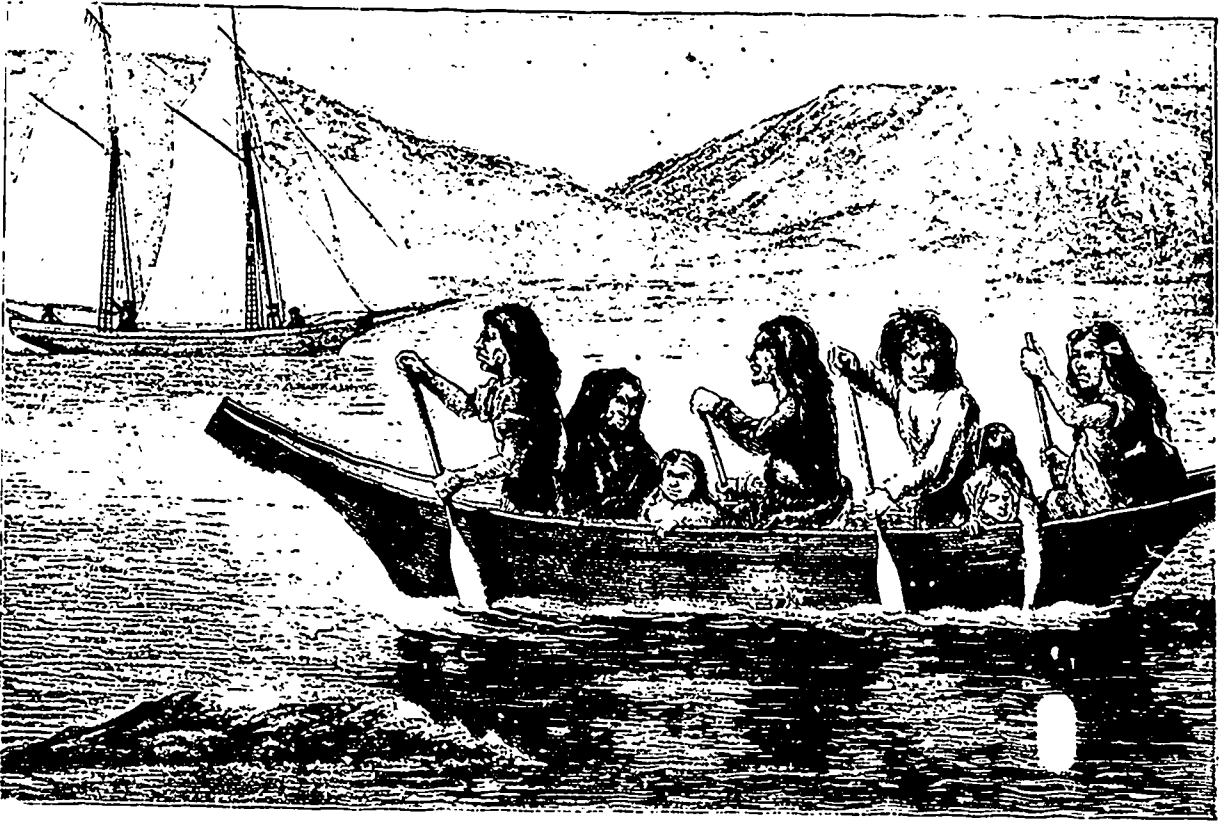
INDIANS OF BRITISH COLUMBIA.

of the Canadian Pacific Railway. The parsonage at Kamloops was a log house of two stories, but ceiled and papered and very comfortable inside. The church, which is a quarter of a mile from the house, is also built of wood, and, though small, is handsome, and internally supplied with everything that is "nice and proper." Kamloops itself is a town of about two thousand inhabitants, and is prettily situated in a valley with high surrounding hills, at a spot where the North Thompson River joins the main stream. In and about this town are to be found many Chinese. In fact, they form a large portion of the population, and are variously employed in sawmills, laundry work, and other such industries. There is even a Chinese "doctor," who advertises himself as Doctor Jin Gin Tong; and a "general store" owned by Kwong On Wo & Co.