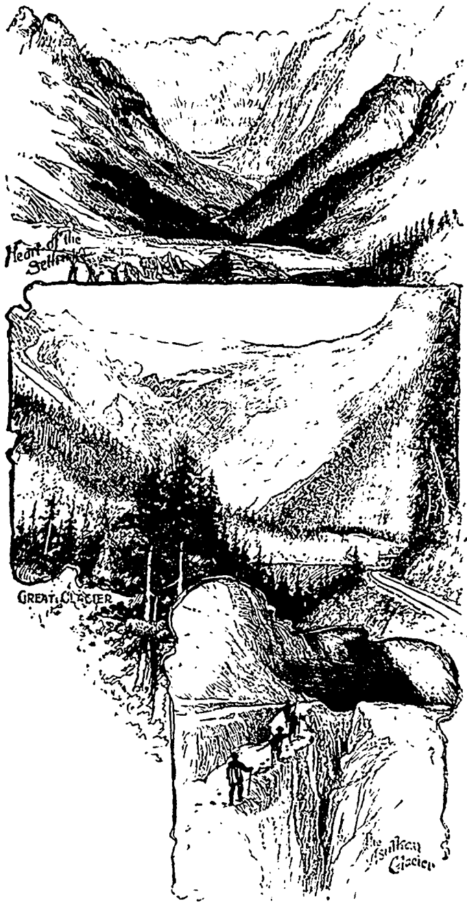
HEART OF THE SELKIRKS. (See p. 219.)

he was concerned, were over, and that the struggle for the mastery between archbishop and king was to be resumed.