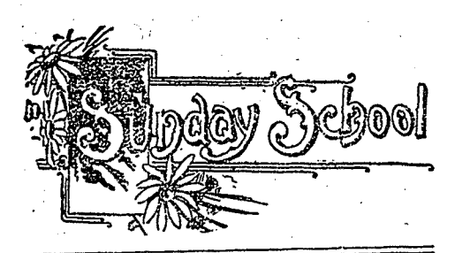
LESSON X .- JUNE 9.