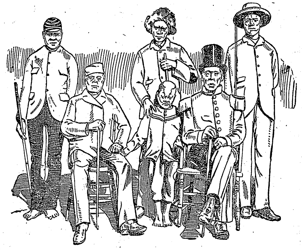
A BASUTO CHIEF AND HIS SONS

That letter is now before me, and is an account of his dream. He says: "About the dream, I never saw you more distinctly in my life. I was in your office, and you were arranging your papers in my dream. In answer to questions I gathered that though all ready to go to X., you had not sufficient money to pay the fare, and I knew that it was really because I had doubts on this point that I had called to see you. Then I saw in my dream that