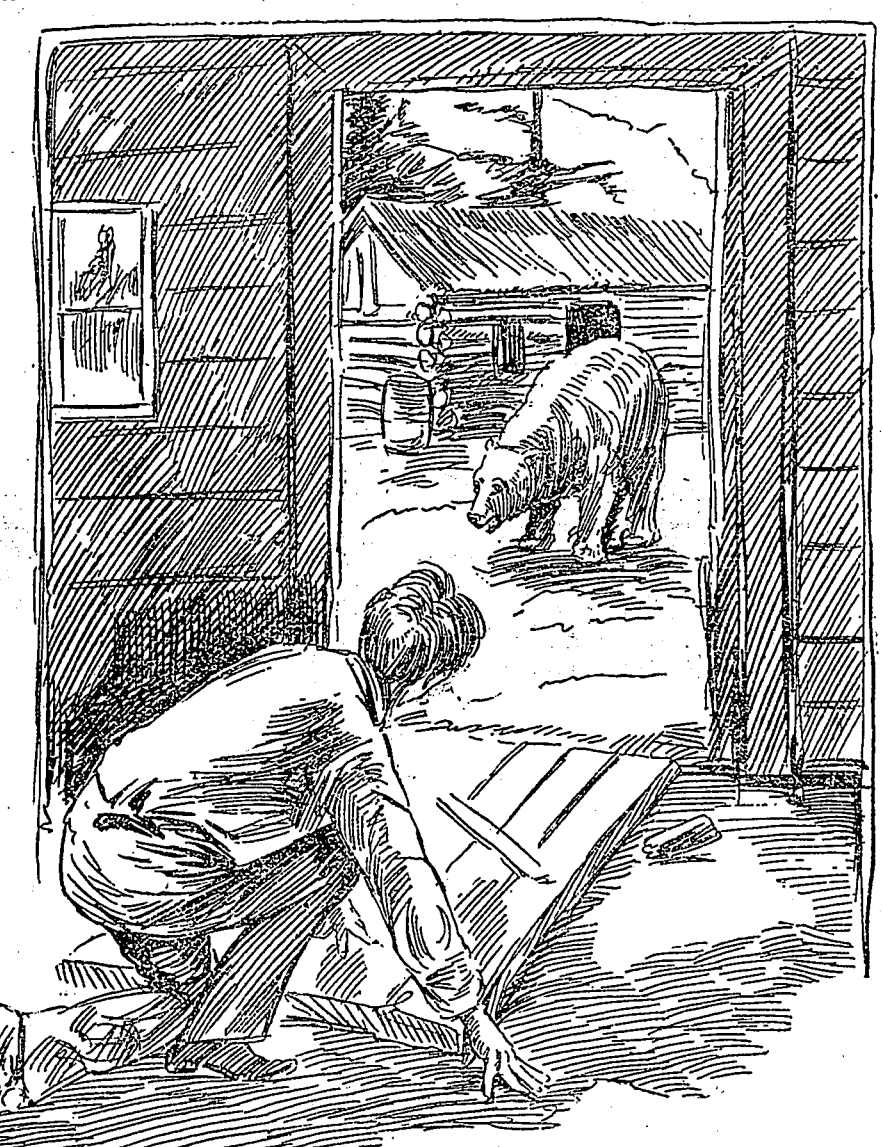
HIS HEAD SWINGING FITFULLY TO AND FRO IN THE MOONLIGHT

Of the exceeding loneliness of my life here I shall not attempt to say much, but it was not without its enjoyments. The tremendous mountain scenery, at first so forbiddingly grand, took on in time a more familiar and friendly aspect. Out to the westward, steel-gray peak Sir Donald and the Hermit Mountain towered mid-heaven, crowned with eternal snow and ice. How many hours I watched the play of the golden sunset on those tremendous rock-pinna-