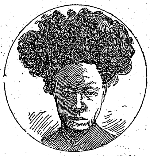
NATIVE WOMAN OF LUKOLELA AWAITING THE ATTENTION OF HER HAIR-DRESSER.

'I send you a photograph of hair-dressing