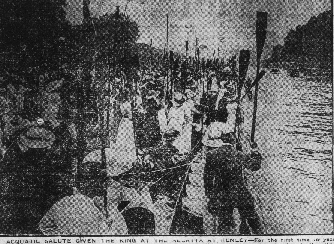
the Henley Regatta was this year under royal patronage, the King and Queen being rowed up the river in the gilded barge used by the Kings of England centuries ago. The picture shows the big flotilla of spectators giving His Majesty the acquatic salute—with oars uplifted—looking a veritable young forest.

ecure from Europe the funds, especally the gold, which were needed in rder to build up credit and end the urrency panic. Some years earlier Mr. Morgan found t necessary to have on deposit in Lonon on a certain day $25,000,000 with