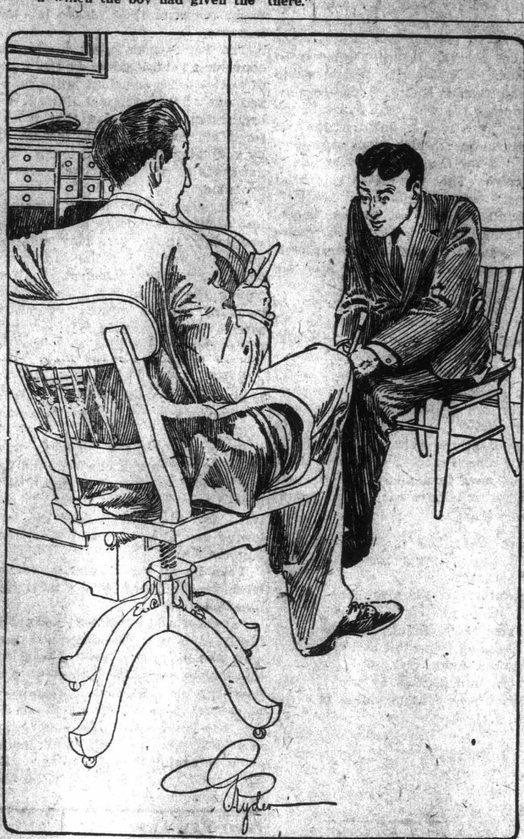
"SHE'S GOING TO MARRY THE HON. ALMERIO ST. AUBYN."

"I guess I'll take a trip across the water." replied Pike dreamily. "Al-ways wanted to see those foreign parts, those Venices and Romes and Londons. Must be a queer tribe over there, Tom. Not much like us plain folks here, eh? Lots of high and mighty dukes and earls and things and This romance deals with a could see the worn steps leading up to coats of arms and crowns and coaches