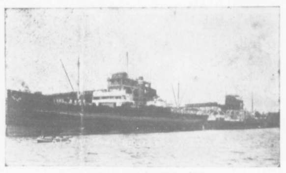
DCEAN LINERS TAKING ON COAL

find Nanaimo a most desirable place and with every facility both for receiving their raw material and for distributing their finished goods. Nanaimo enjoys the same terminal rates as Vancouver and Victoria, giving a deferential at least of $4 per ton. Fuel is very cheap both wood and coal being produced in immense quantities and being shipped to