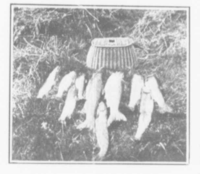
THE GAMEY TROUT ARE DIENTIFUL

increase over that of the 13,000,000 pounds, and water mark output in fishing industry in Nanount of capital invested present time is estimated constructing a saltery is ing the driving of piles, etc. Add to this the boats, launches and average cost of a camp total for the forty-three