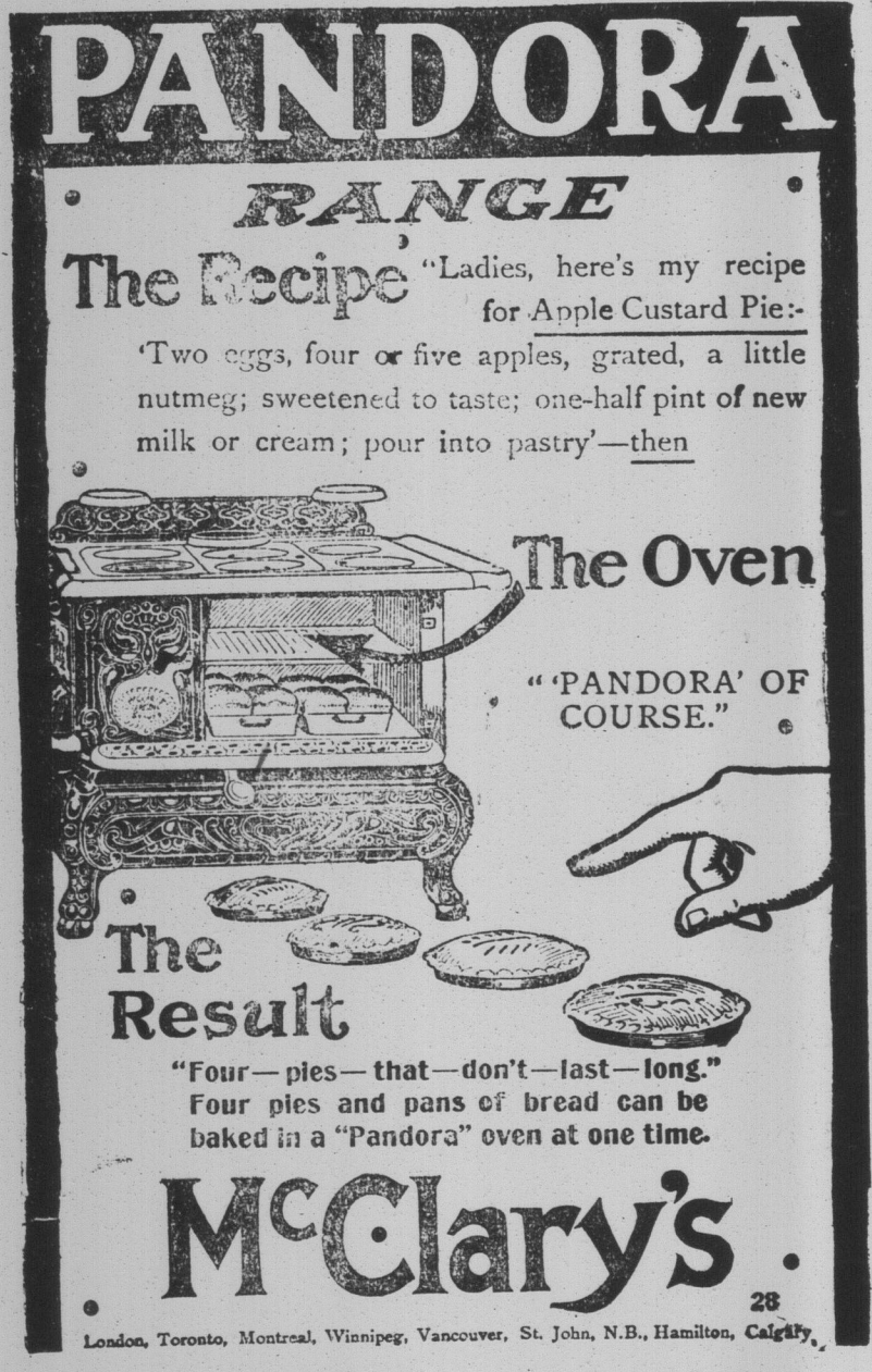
CHART & MORIN

There's a widow in sleepy Chester Who weeps for her only son. . There's a grave on the Pabeng river, On the top of the mourh of triumpl A grave that the Burnmans shun; And there's Subadar Prag Tewarri, With the sword and the peacod Who tells how the work was done. A snider squibbed in the jungle-Somebody laughed and fled. And the men of the 1st Shikaris Picked up their subaltern, dead,