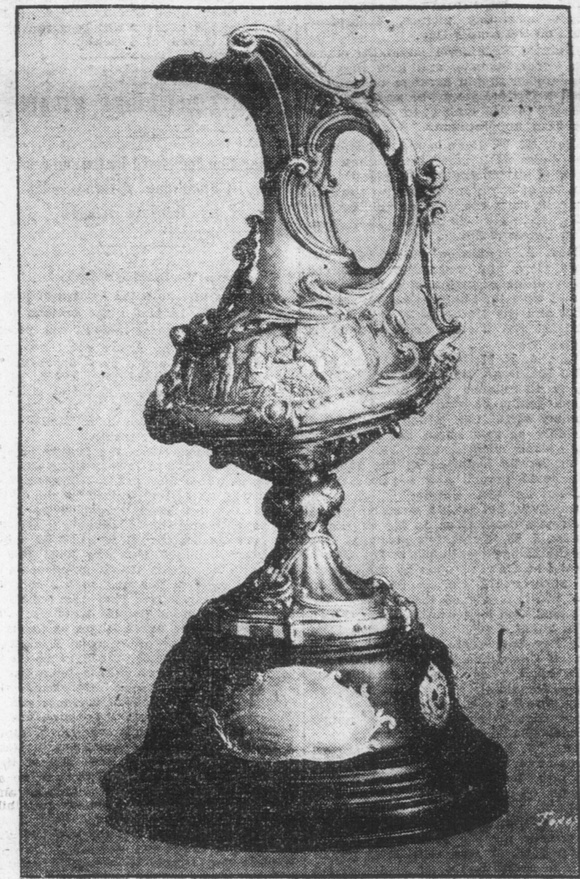
Presented to the Imperial Troops on the Occasion of Their Departure From Victoria.