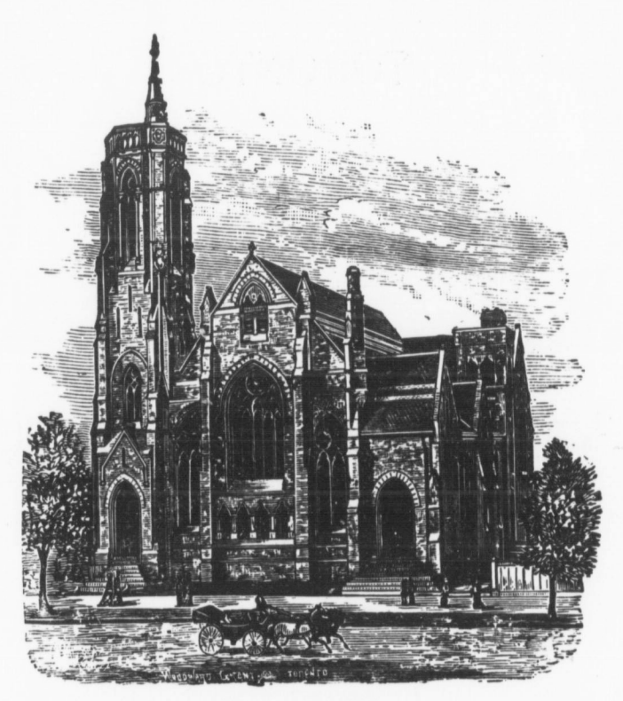
ST. JAMES SQUARE PRESBYTERIAN CHURCH.