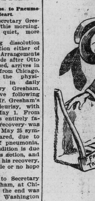
Lord Rosebery's Bill Meets a First Time in the House of Lords - Only Supreme Court Judge Who is Not Attached to the Bench.