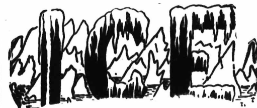
THE BEST FOR HOUSEHOLD USE.

IT is clear as crystal and entirely free from snow and all impurities, every block being specially treated after leaving the water.