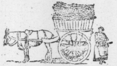
CHIEF USED IN HAULING PEAT.

Threatened by a scarcity of coal, it is entirely probable that the English people will turn to their fields of peat as a resource. Besides the extensive fields to be found in Scotland and Ireland, there is considerable quantities of it in England as well. In Yorkshire, Devonshire, Cornwall and Somerset, says a writer in the Golden Penny, peat is to be found. I believe it is only in the latter county that it is made use of for fuel.