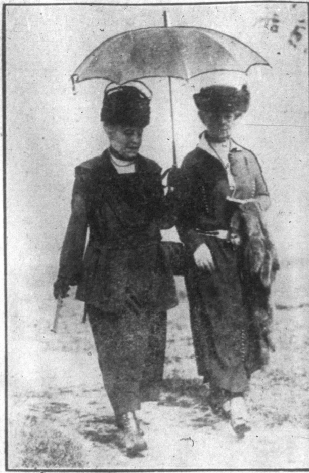
Mrs. Andrew Carnegie (left) and her niece. This is the first photograph in years of the widow of the famous steel magnate.