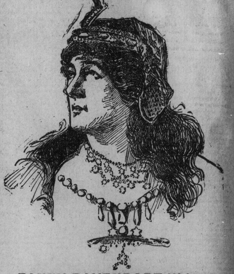
FANNY DAVENPORT Writes:

Vin Mariani has been the most wonderful tonic for me. At times when I felt completely worn out and unable to exert myself after a matinee, a small quantity taken has strengthened me and carried me through the task with a sort of SUPERHUMAN POWER. I consider Vin Mariani the most wonderful tonic of this age.