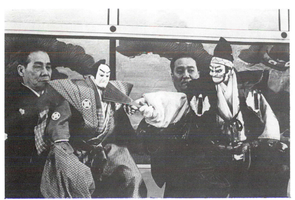
"Tsuri Onna" scene of great drama from classic Bunraku repertoire.