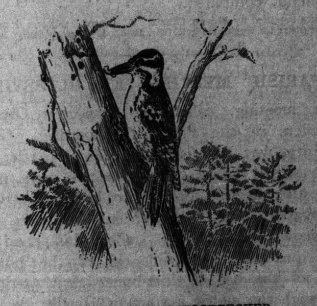
Fig. 3.-THE HAIRY WOODPECKER Doing his best to reduce insect life.

"The crow doth sing as sweetly as the lark When neither is attended,"