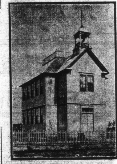
BAWLE PUBLIC SCHOOL