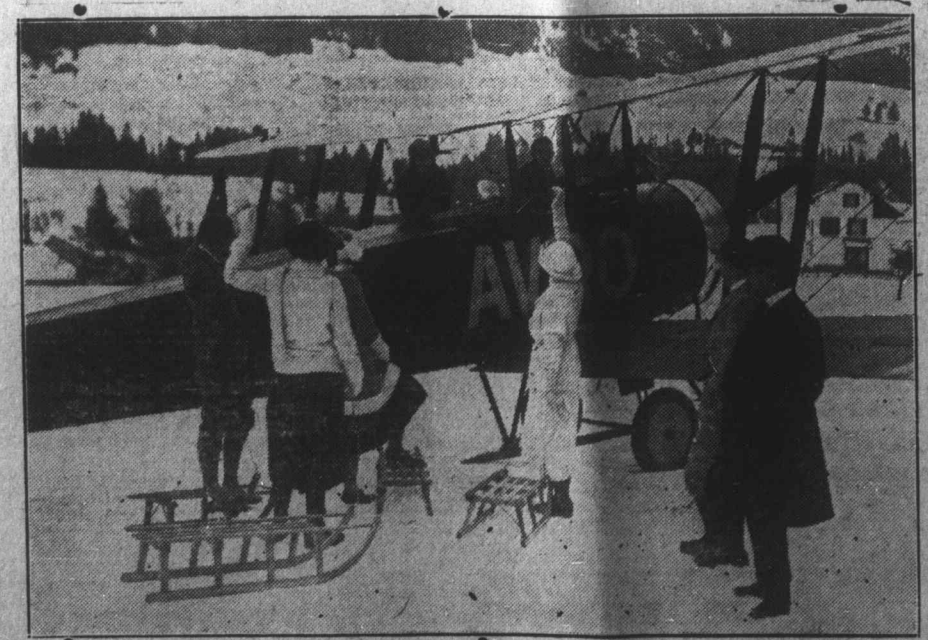
A new thrill for visitors has been introduced at certain Swiss resorts in the form of aeroplane trips over the Alps. Advertise in THE ACADIAN. The photo shows some friends of a fair passenger waving good-bye as she was about to start.