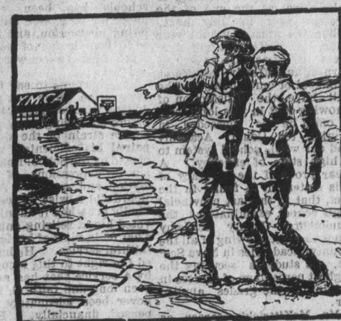
Cheer Up and Thank God for the Y.M.C.A.

TRY to picture yourself in the muddy cold trenches after exciting days and long nights of mortal danger and intense nervous strain. Rushing "whiz-bangs" and screaming "coal boxes" are no respecters of persons. You are hit But despite shock and pain you still can face the long weary trudge back to dressing station. Weary, overwrought and depressed, you are prey to wild imaginings of that other coming ordeal with the surgeon. There are other "walking wounded," too! You must wait, wait, wait. And then—