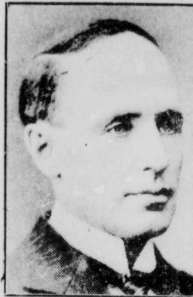
Right Hon. Arthur Meighen Premier of Canada, who addressed the big mass meeting in Hamilton last Monday evening.

The Weaver store, which has been in operation here for the past nine months, has been incorporated in the Carroll stores and is now being operated by the Wm. Carroll Company.