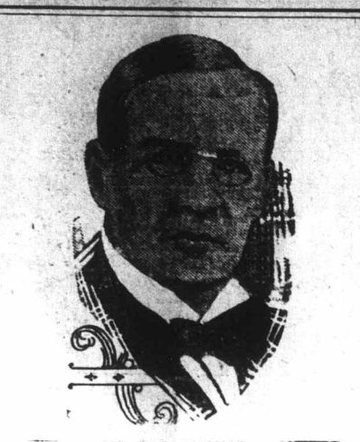
MR. D. A. THOMAS. Who is representing the British Munitions Department in Canada. He was in Montreal last night and is now in Quebec.

North American Life Assurance Co. "Solid as the Continent." HEAD OFFICE — TORONTO, CANADA.