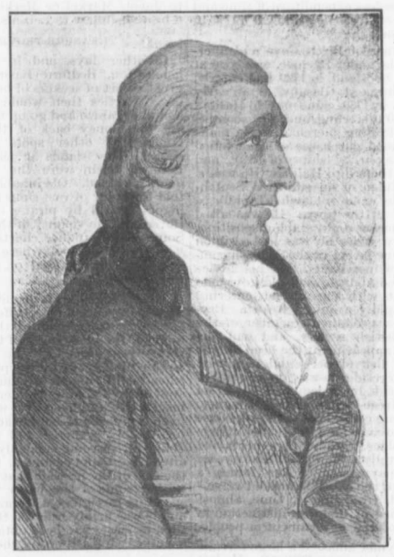
THE HONORABLE ALEXANDER BRYMER.