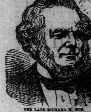
THE LATE MR. HOE. The portrait of Col. Richard M. Hoe in Florence, Italy, shows the career of one whose name is known wherever the newspaper is used to spread intelligence.

ONE OF THE CELEBRATED INVENTORS OF THIS CENTURY.