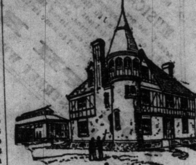
THE HOME FOR DOGS.