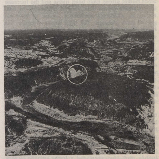
Circled area indicates the site of the Manic 3 station.

To minimize the time and cost of building the main dam, Hydro-Québec is applying the results of the first comprehensive, computer simulation studies that have ever been made for a construction project. These studies have contributed greatly in the selection of machinery and construction methods, and have solved in advance many of the scheduling and dispatching problems that will be encountered during construction. When construction begins, the computer simulation model will be made an integral part of the production control system. (One of a series).