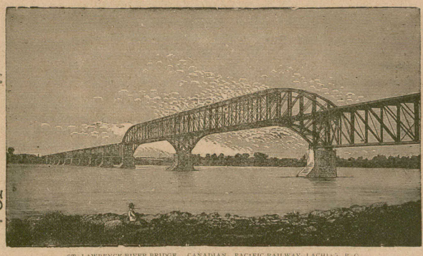
ST. LAWRENCE RIVER BRIDGE, CANADIAN PACIFIC RAILWAY, LACHING P. Q.

For Railways and Highways, Iron Bridges, Turntables Iron Piers and Trestles,