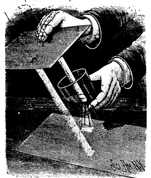
Fig. 1.—REFRACTION AND DISPERSION.

FILL an ordinary drinking glass, having a plane bottom, one-third full of water and incline it, as shown in the engraving, so that the water forms a prism. This permits the observation