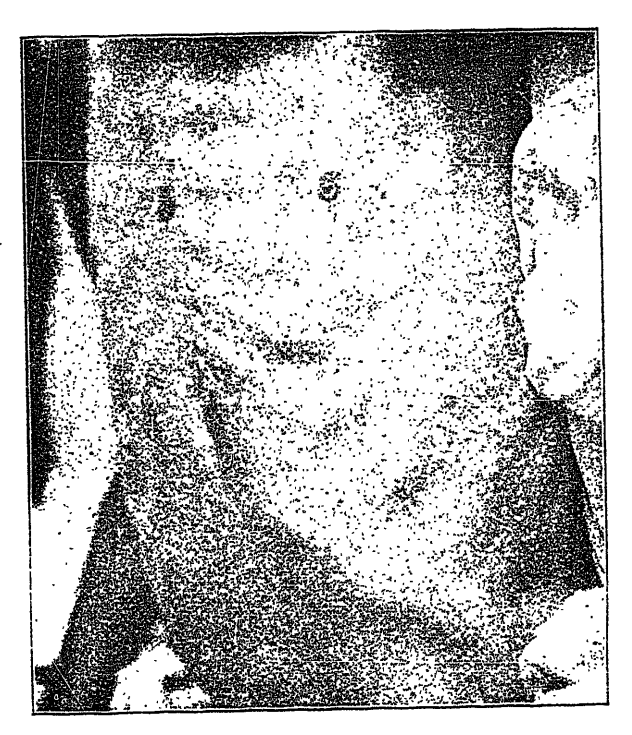
HÆMORRHAGIC ERUPTION IN TYPHOID FEVER. Portion of Thorax and Abdomen from Case No. III.