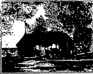
FIG. 63—THE PRINCIPAL ENTRANCE.