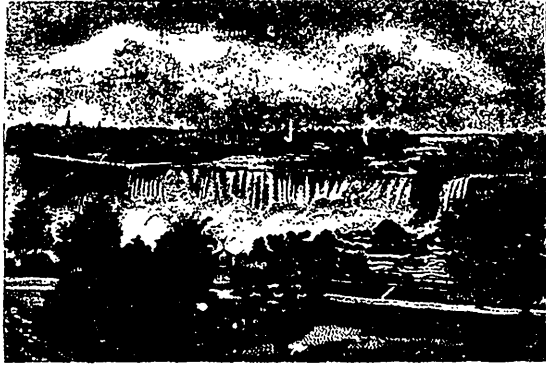
FIG. 64—AMERICAN FALLS—FROM BLUFF OVERLOOKING PARK.

He plants his currants, gooseberries raspberries, etc., all six feet one way and four feet the other, so that he can cultivate two ways, a great saving of hand labor over the common method of planting in rows one way only. He complains that the Souhegans and Tylers have suffered very much from rust. The same was also true of the Saunders, of which he has quite a large number. He does not