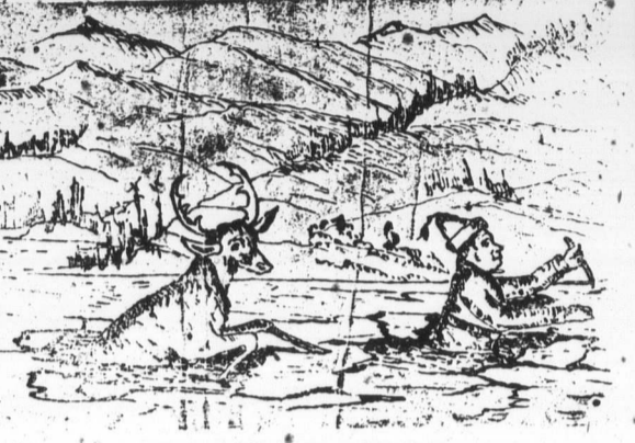
THE HUNTER'S STRUGGLE FOR LIFE