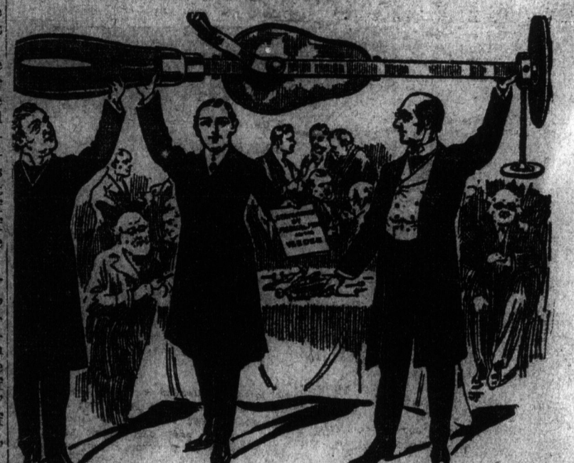
The emphatic and unanimous approval of the British Medical Profession has been accorded the Veedee.

This is the generous offer made by the Veedee Demonstrators, to prove at their own cost, to the Sufferers of New Brunswick the marvellous healing power of this great English invention.