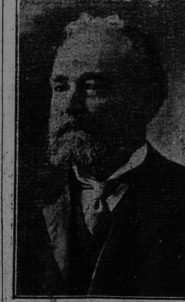
HON. WM. PUGSLEY.