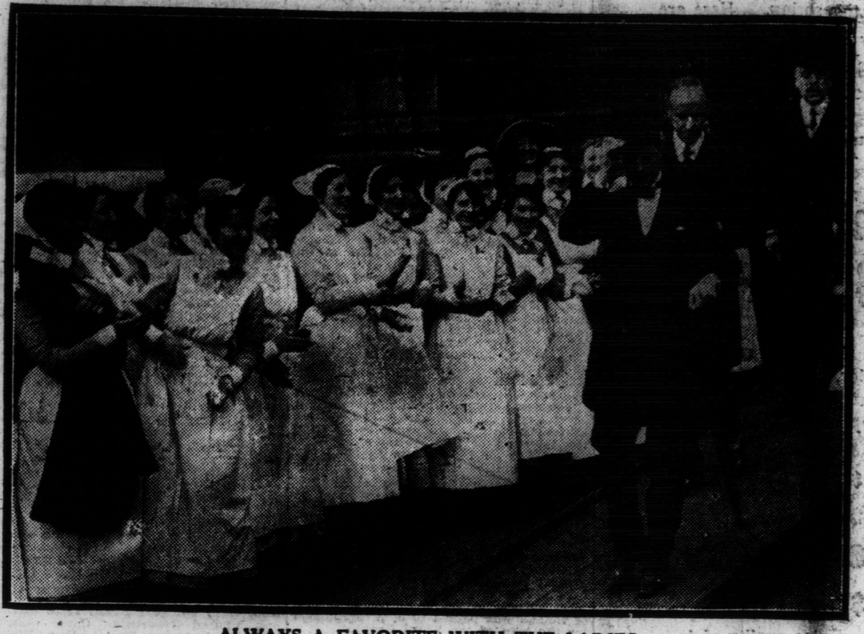
ALWAYS A FAVORITE WITH THE LADIES The Prince of Wales is popular wherever he goes—even at home. If you think English girls don't like him—look at this picture. The nurses of St. Bartholomew's Hospital, London, are here giving him a royal greeting. He looks a little shy—is it any wonder?