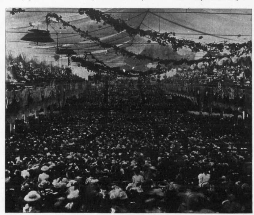
A BIG MEETING AT THE MECHANICS' PAVILION, SAN FRANCISCO.

But what is the good of the Epworth League, any way? What is the good? Why, sir, the significance of this movement is deeper far than many can see,