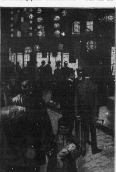
A STREET IN CHINATOWN

Almost every tourist visiting Chinatown wants to see an opium-joint. This desire is easily gratified, for opium-dens are plenty in Chinatown, and many Chinamen are given over to the terrible vice of smoking opium. These dens exist