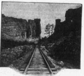
ON THE RIO GRANDE WESTERN

complished by means of irrigation. Without it Colorado would be a barren desert. After a very busy day a lot of tired