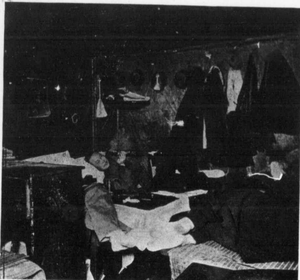
AN OPIUM DEN, CHINATOWN.

There is a lesson here for Christians who neglect the very source and pulse of inspiration in well-doing—the word of