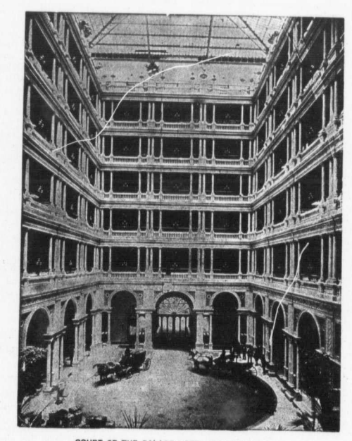
COURT OF THE PALACE HOTEL, SAN FRANCISCO. Where the Noon-day Prayer-meetings were held.

is the Waterloo of the moral universe. The issues of the present conflict will affect all coming ages and move all worlds. This is no time for dilly-dallying; no time for languid effort, or luxurious ease, or ostentatious parade. Hark! the bugle calls to battle. Let every soldier in the ranks of God's army unsheath the weapon of His spiritual warfare, and strike for God and victory. Oh, that our great Captain would breathe upon us from on high the spirit of an all-conquering enthusiasm, something that would enable us to sweep through the serried ranks of darkness, as the British did at Tel-el-Kebir, capturing every gate of hell and compelling every citadel of the foe to surrender.