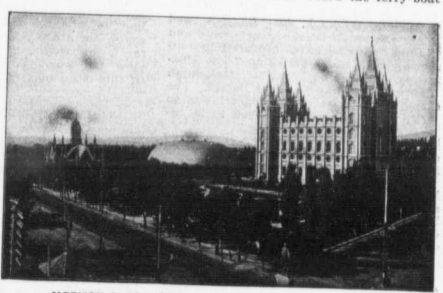
MORMON TABERNACLE AND TEMPLE, SALT LAKE CITY.

over the fertile pains of California. It was five o'clock on the afternoon of Tuesday, July 16th, when we left the train, and went on board the ferry-boat