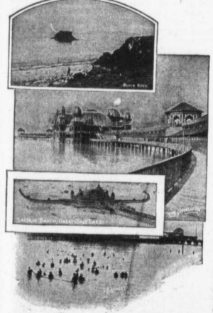
VIEWS OF SALT LAKE

avoid travelling on the Lord's Day. Unfortunately traffic became so congested on Saturday night, that our train was unavoidably delayed, so that we did not reach the "City of the Saints" until after reach the "City of the saints" until after noon. We were met by a reception com-mittee of young ladies and gentlemen, who did their best to make our stay with pleasant and profitable. specially requested that none of our party should visit the Salt Lake on the Sabbath. It was quite a disappointment to bath. It was quite a disappointment to many, as they had anticipated a dip in the lake. Nearly all denied themselves the pleasure, and spent the time attending the meetings which had been planned.