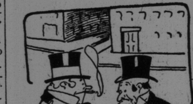
Old Skinfint (a millionaire) - Rigson's getting very extravagant. Old Squozem (another millionaire) - What's he been doing now? Old Skinfint - Bought a paper this morning and read only half of it.