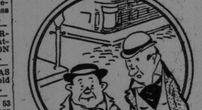
THE CURTAIN LECTURE. De Quiz - Did you get home before the storm broke last night? De Fitz - Of course; the storm never breaks at my home until I get home.