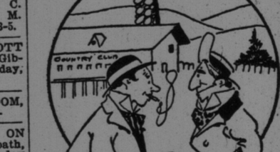
HE WAS SAFE. Chawlin - The wude fellah actually threatened to blow out my brains, but I defied him! Dolly - You knew it was impossible, didn't you?