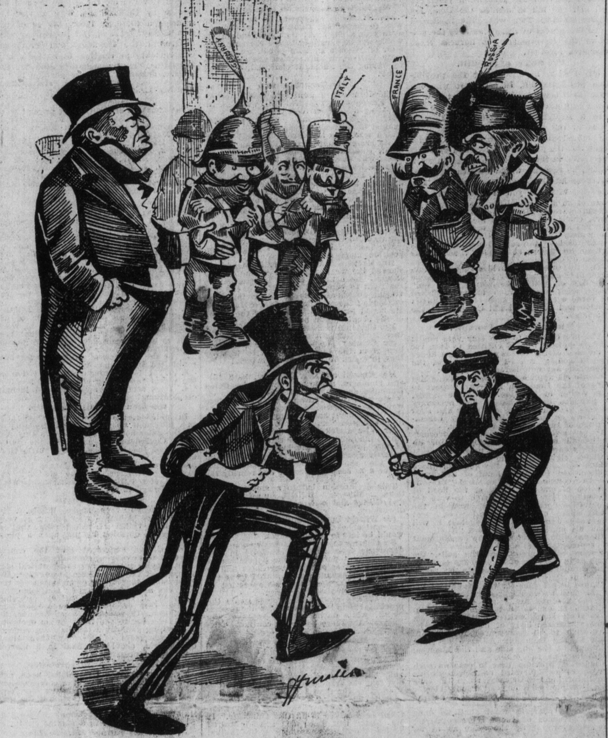
Mr. BULL (to the Powers): I don't pretend to be a fighting man, gentlemen, but I'm going to see that there's no interference.