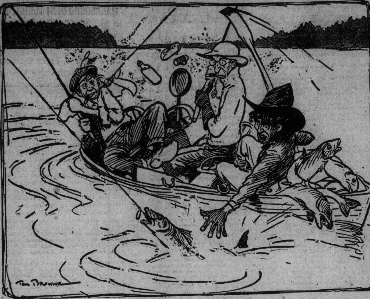
AN EXCITING MOMENT.