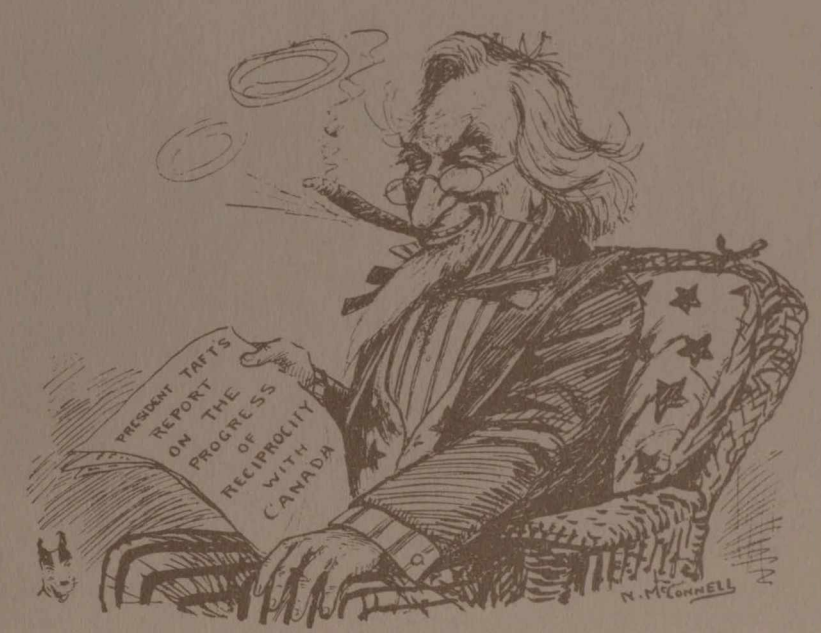
UNCLE SAM—"I CAN ALMOST HEAR THEM SINGING THE STAR SPANGLED BANNER" IN OTTAWA, BE GOSH."

More grist for the Canadian opponents of reciprocity