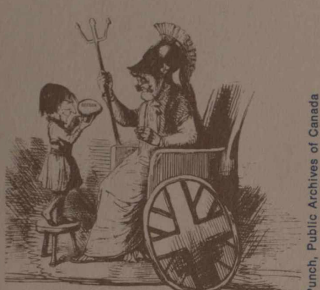
Young Yankee Doodle teaching geography to Britannia

It was created in 1783 at the end of the American Revolution. Canadians thought it should follow the Ohio