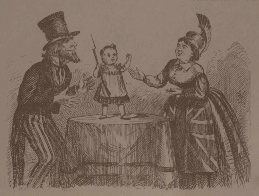
MOTHER BRITANNIA.—" See! Why, the dear child can stand alone!" UNCLE SAM.—" Of course he can! Let go of him Granny; if he falls I'll catch him!"