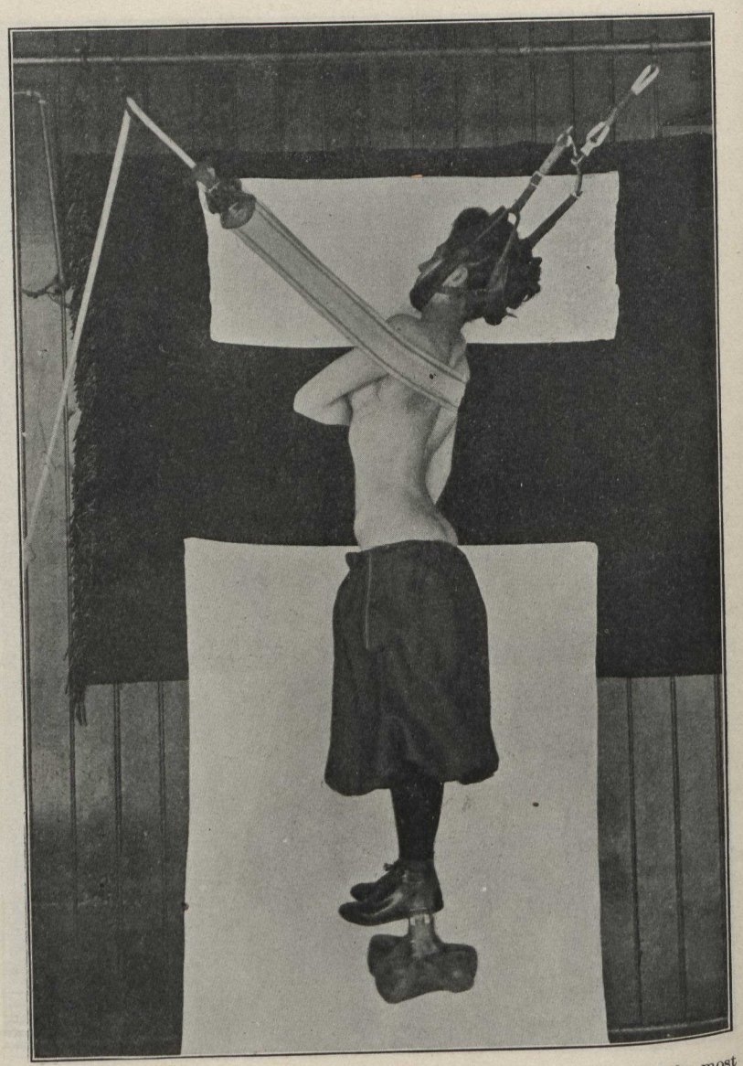
Fig. 3. Showing extension by appliance to the head, with corrective force to the most prominent part of the curvature and heavy weights to the feet.

The one feature of lateral curvature which impresses the laity is the lack of symmetry, and this is a matter of importance, especially in women. The lack of symmetry will not have advanced far before there