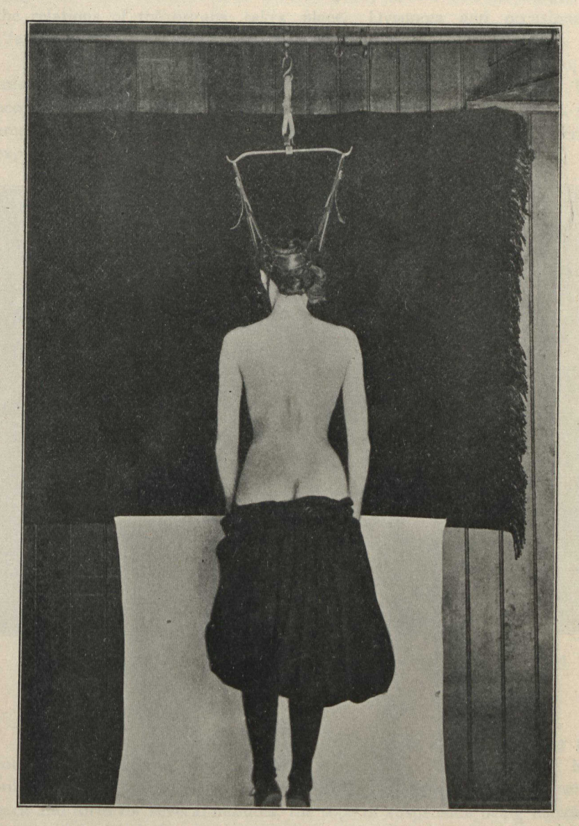
Fig. 2. Showing extension of the spinal column from the head alone.

pathology, sometimes presenting upon the surface of the body the same appearance in the earlier stages as that seen in ordinary roto-lateral deviation. A recollection of the fact that one is a serious disease to