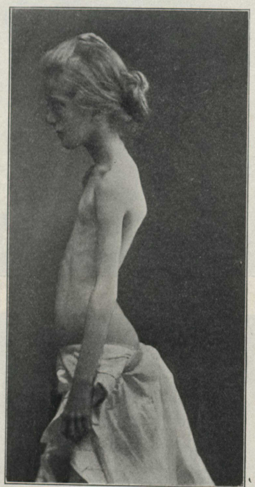
Fig. 7. Showing the condition of a patient without an effort to correct deformity.

In employing the means above referred to and in the use of all methods where force is employed to exert a corrective influence, the power is one outside of and quite apart from the patient herself and acting independently of her will. Such means do much to render the spine more supple and to make it possible for the patient to assume voluntarily