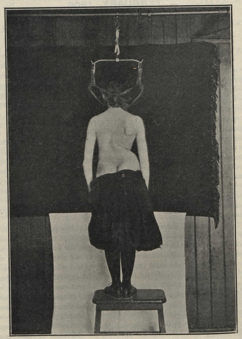
Fig. 1. Showing Roto-Lateral Curvature with appliance adjusted, but extension not yet made.

lateral deviation, but there is marked rotation or twisting of the vertebral column and bending of the ribs, most marked at the part where the spinal twist is greatest.