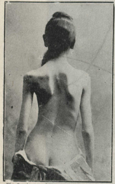
Fig. 9. A case of Roto-Lateral Curvature.

It is not necessary here to lay emphasis upon the benefits resulting from muscular development; but it is important to emphasize the fact that other results should be looked for and obtained which are of vastly greater importance and more valuable in the after life of the patient. Among the chief gains which may be named are an erect bearing, deeper habitual breathing, more prompt response to any stimulus calling forth action, and economy of force and time in the performance of every movement.