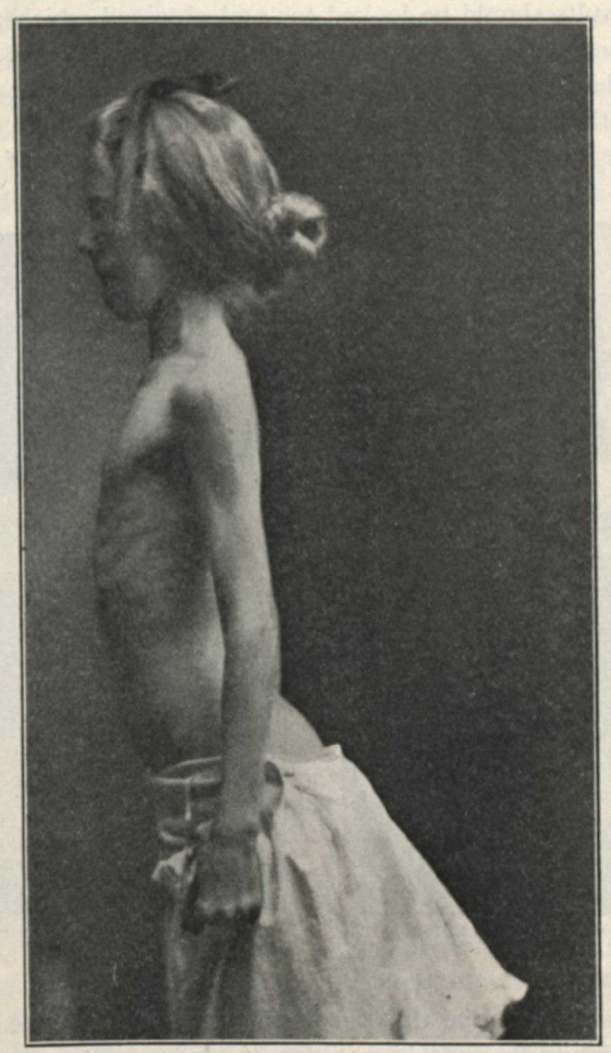
Fig. 8. The same case making a voluntary effort in front of a mirror to correct the deformity after training.

pelvis, the patient is shown her ordinary attitude as seen from in front and also from behind. She is then carefully instructed and helped to assume the best position possible for her and allowed to practise before the mirrors until she can readily assume this best position, though she may not be able to hold it for more than a minute. She is now given a wide variety of free symnastic work, preferably, exercising in a class