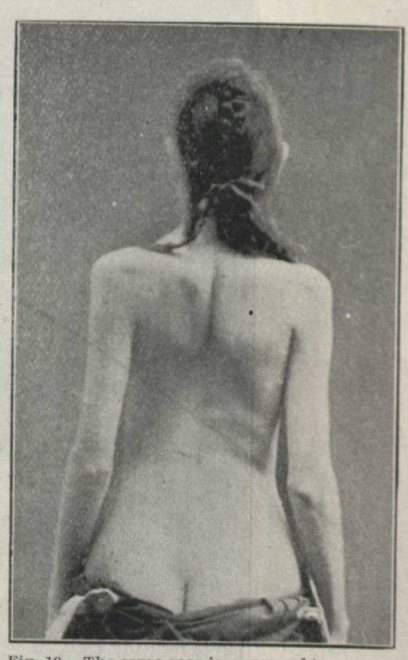
Fig. 10. The same case in course of treatment.