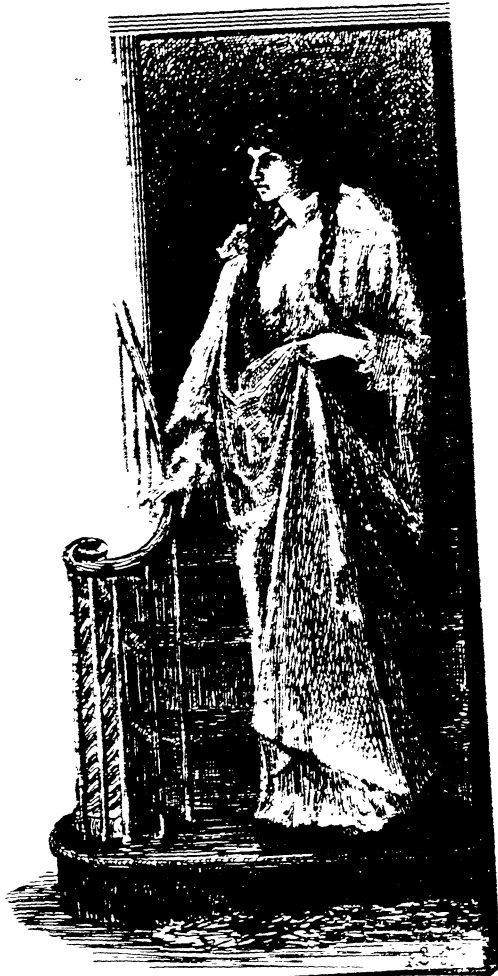
Had I turned e'er I crept down the stairway." — Page 29