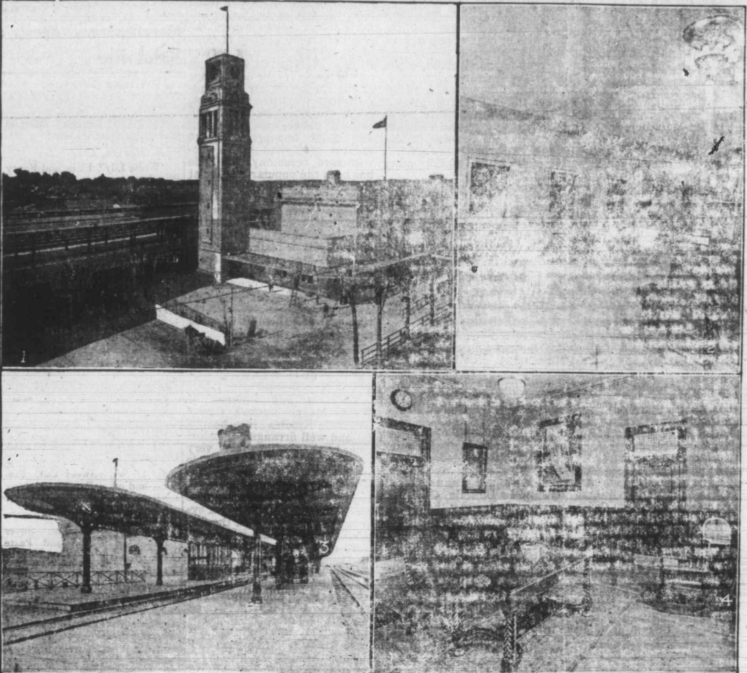
(1) New C.P.R. North Toronto Station. (2) Ticket Office. (3) Train Platforms. (4) Ladies' Waiting Room.