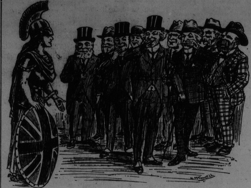
HOW BRITANNIA'S WARNING WAS RECEIVED BY THE LIBERAL PARTY

BULLETIN---London, April 14, 3.18 a. m.---"After prolonged negotiations," says the Daily Mail's Rome correspondent, "Italy has agreed with the Entente!" powers to support Serbia's claim to an outlet on the Adriatic coast."