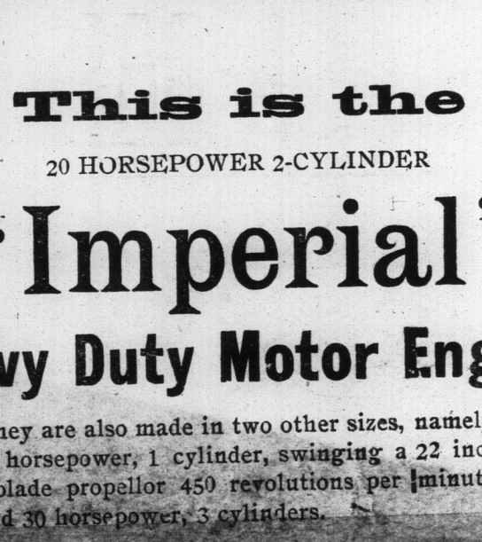
Imperial Heavy Duty Engine

They are also made in two other sizes, namely, 10 horsepower, 1 cylinder, swinging a 22 inch 3-blade propeller 450 revolutions per minute, and 30 horsepower, 3 cylinders.