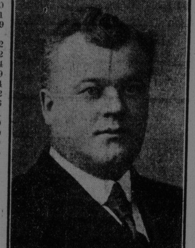
THE NEW LEADER