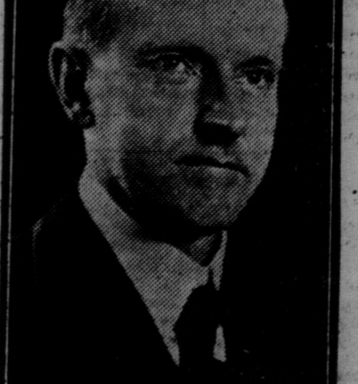
Caption for the portrait of a man.

Continuation of the article on the mass meeting to take a strike vote.