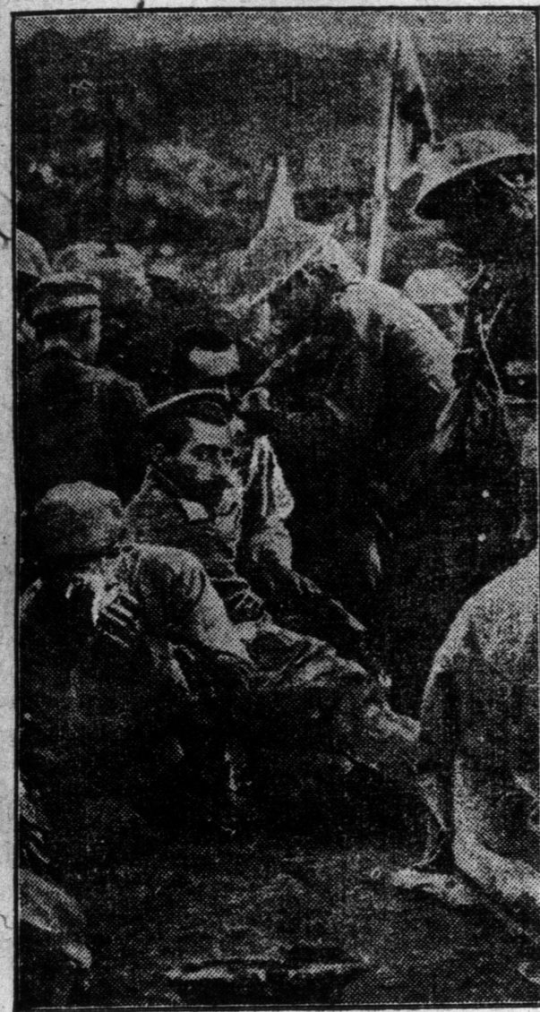
Dressing Wounds of the Enemy.