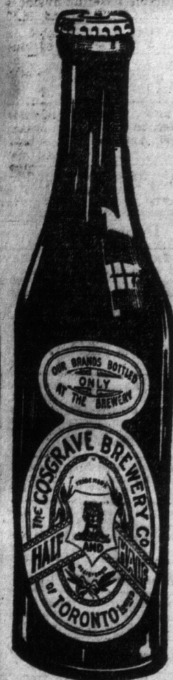
The ONLY Chill-proof Beer.

For over half a century the Cosgrave label has meant the best in malt and hop beverages.