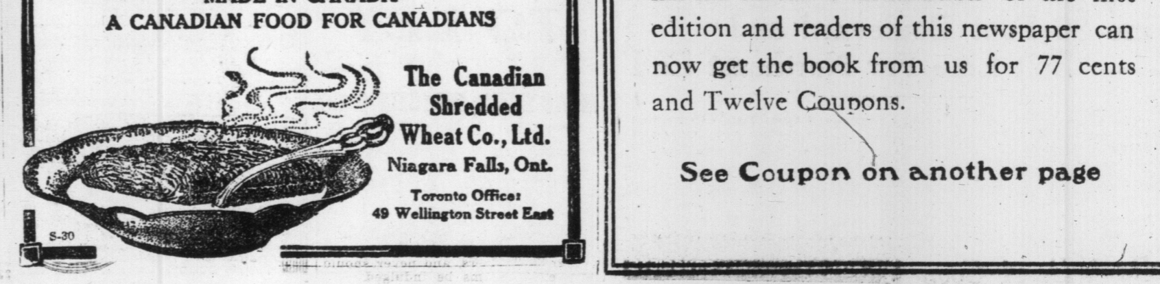
The Canadian Shredded Wheat Co., Ltd. Niagara Falls, Ont. Toronto Office: 49 Wellington Street East

MADE IN CANADA A CANADIAN FOOD FOR CANADIANS