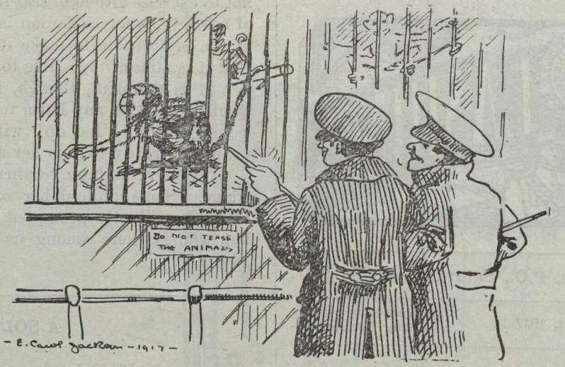
1st Sapper:—"Say Bill what's that feller?" 2nd Sapper:—"Can't yer see he belongs to the Mounted Section?"

Sapper:—"I beg your pardon, tion, as a restant I washed my feet last night, and I just can't do a thing with them!"