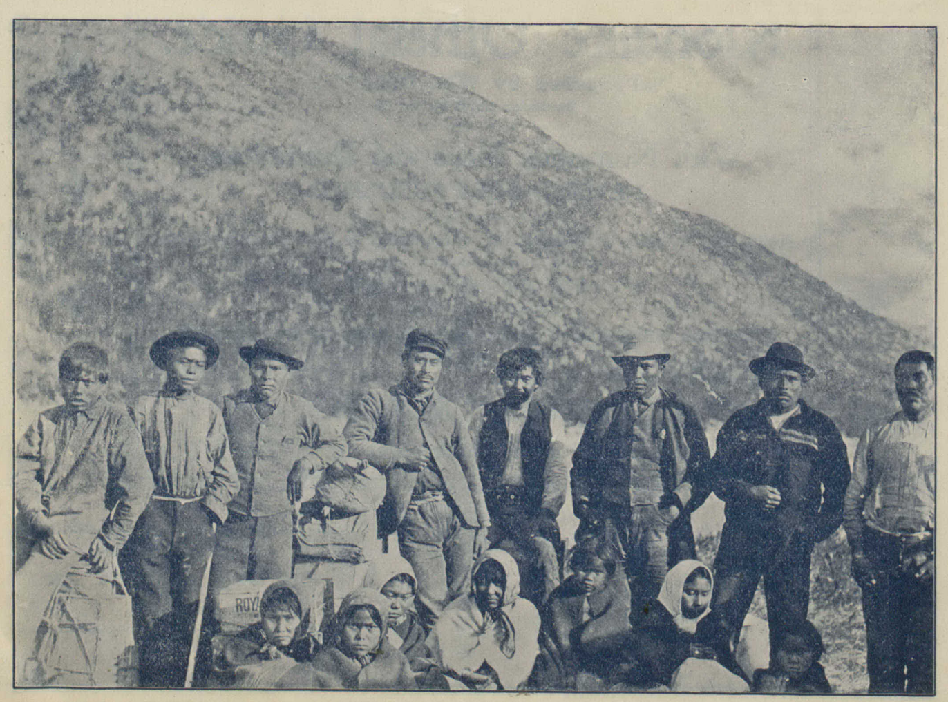
Indian Packers on Chilkoot Pass.