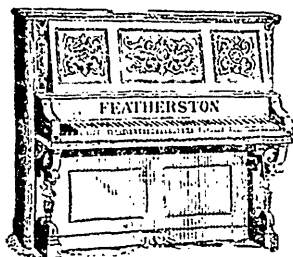
'The FEATHERSTON.' CHESLEY WOODS, Sole Agent.

Old Pianos and Organs taken as part payment. Visit Ware-rooms and inspect styles. Address: 5 Water Street.